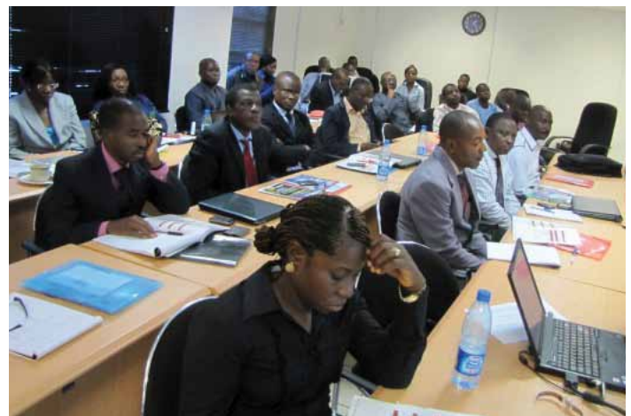
Participants take notes during SOCRON's "Infections and Cancer" Conference.