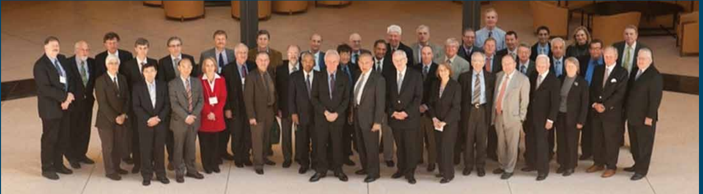
More than 35 of the world's top virologists gathered March 3 to ratify the Global Virus Network (GVN).

On March 3, 2011, top medical virologists representing more than a dozen countries ratified their participation in and support of the newly-formed Global Virus Network ("GVN"), a global authority and resource for the identification, investigation, and control of viral diseases posing threats to mankind. The inaugural meeting of the GVN was held March 1-3 at the Embassy of Italy in Washington, and each of the attendees signed a Declaration of Participation & Support.