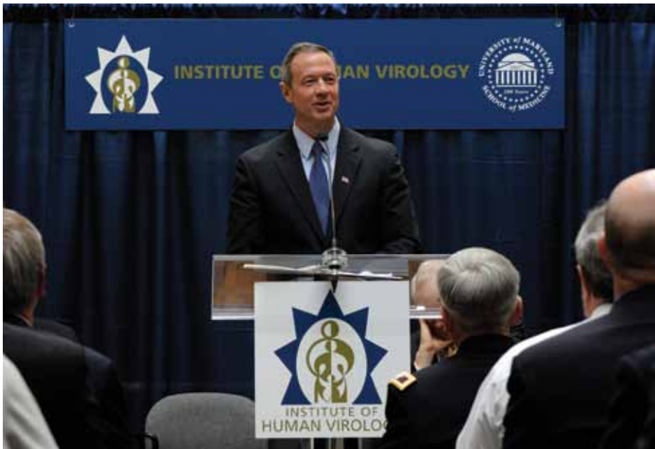
During a press conference at IHV, Governor Martin O'Malley announced $23.4 million in grants for IHV's HIV preventative Vaccine Candidate.