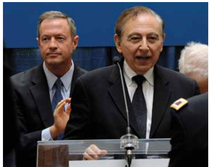
IHV Director Robert C. Gallo, MD commends IHV's public-private partnership featuring the Bill & Melinda Gates Foundation and the U.S. Army in their collective quest to advance IHV's vaccine candidate into clinical trials.

"As the national epicenter of science, health and healing, Maryland has been home to some of the key breakthroughs in the fight against HIV/AIDS," said Governor Martin O'Malley. "I'd like to commend Dr. Gallo, the Gates Foundation, the U.S. Army, NIH, and Sanofi Pasteur. We are proud to support the groundbreaking research being developed by Dr. Gallo and the entire IHV team – it is only by harnessing the skills, talents and education of our people that we can fight this epidemic."