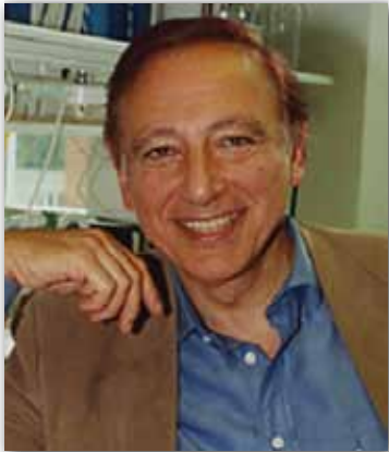
Robert Gallo, MD, Director, Institute of Human Virology, Division of Basic Science and Vaccine Development,

received a six year $16,804,024 award from the Bill and Melinda Gates Foundation for his work entitled "Phase I Clinical Trial of a Novel HIV Protein Construct that Presents CD4 Induced Epitopes." The main goal of this project is to support a